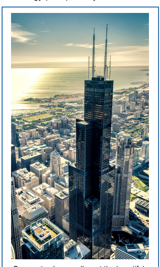
Be sure to plan a walk past the beautiful beaches and gardens on the waterfront of beautiful Lake Michigan while at RhinoWorld Chicago 2019!

in defining the field and simulating further research. The ICAR:SB document is planned for publication in the International Forum of Allergy and Rhinology (IFAR) in early 2019.