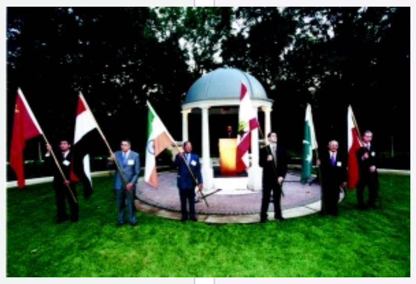
The inauguration of six new countries into the International Rhinologic Society

Thursday morning the scientific sessions were in conjunction with the American Academy of Otolaryngologic Allergy Foundation and Friday the day belonged to the American Rhinologic Society. On Saturday the American Academy of Facial Plastic and Reconstructive Surgery led the way discussing primary and secondary rhinoplasty and covered everything from the