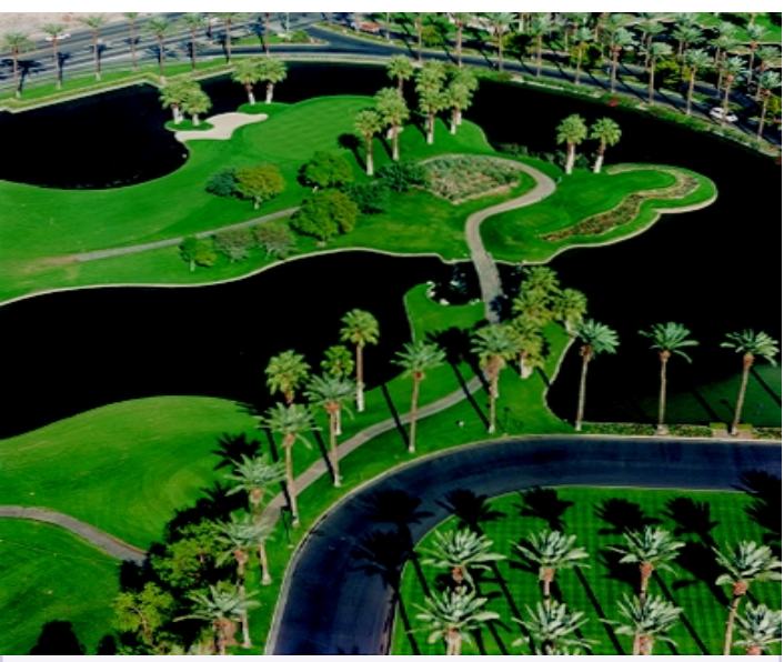
Water hazard at the Desert Springs Marriott