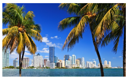
ARS 70th Annual Meeting September 27-28, 2024 Miami, FL

Hyatt Regency New Orleans, New Orleans, LA